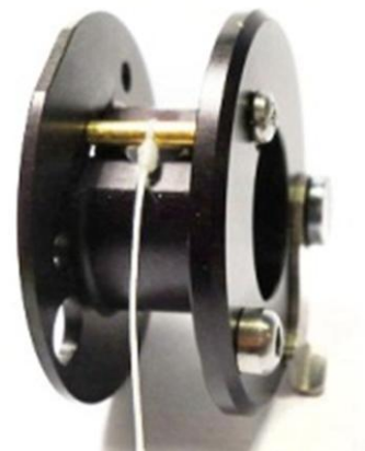
Foto of the finished knot